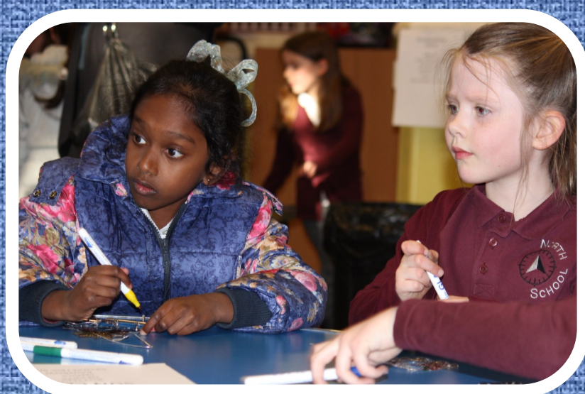
Children's Arts and Crafts