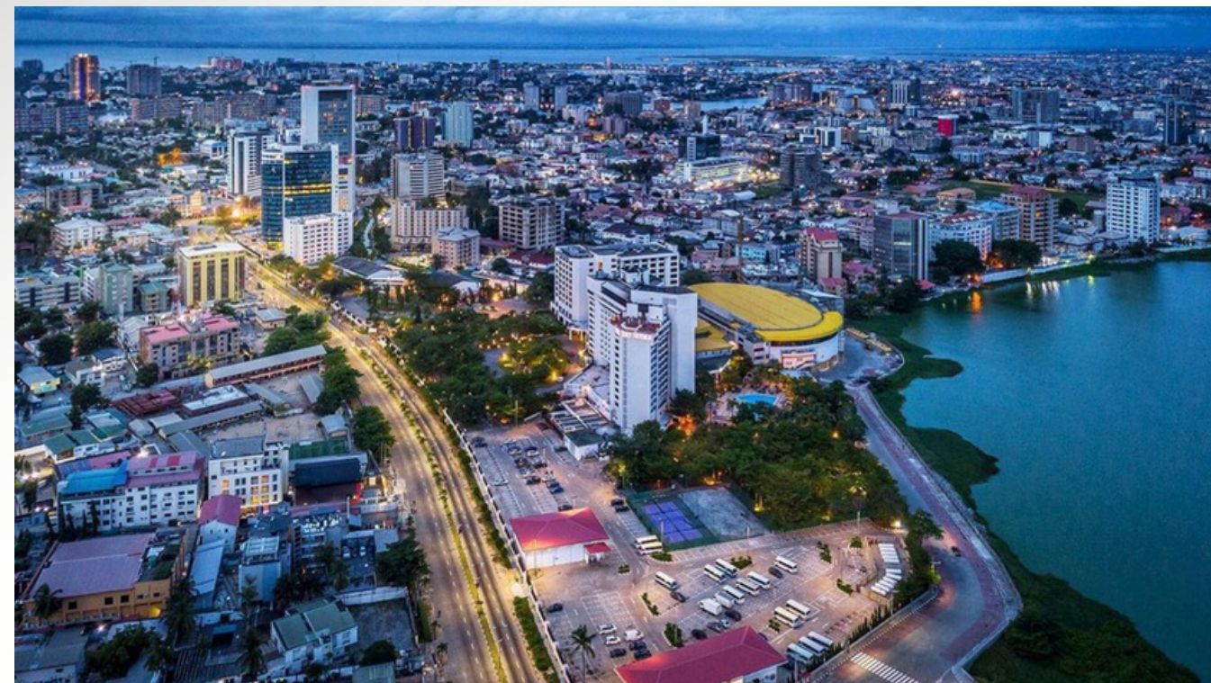
Lagos state the former capital of Nigeria but still the financial capital