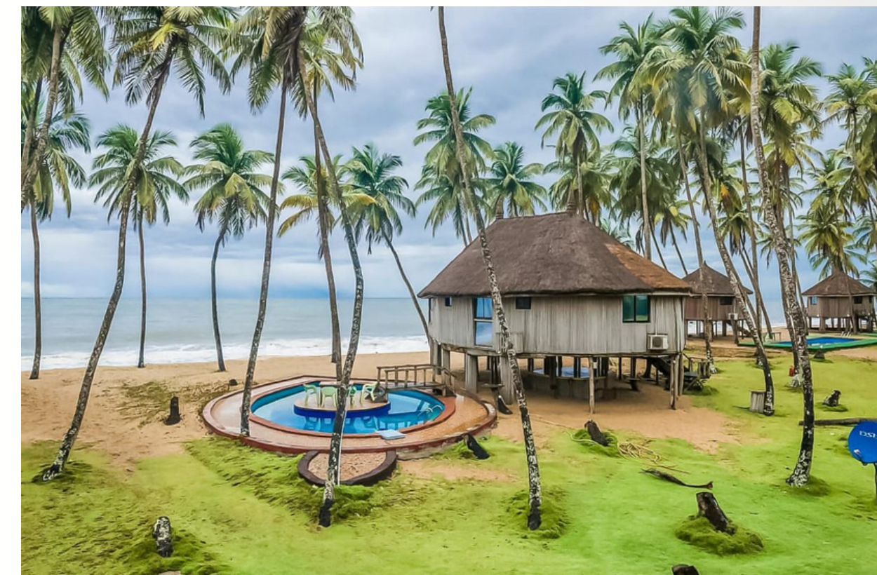
There is more water than land in Lagos state with over 30 beaches