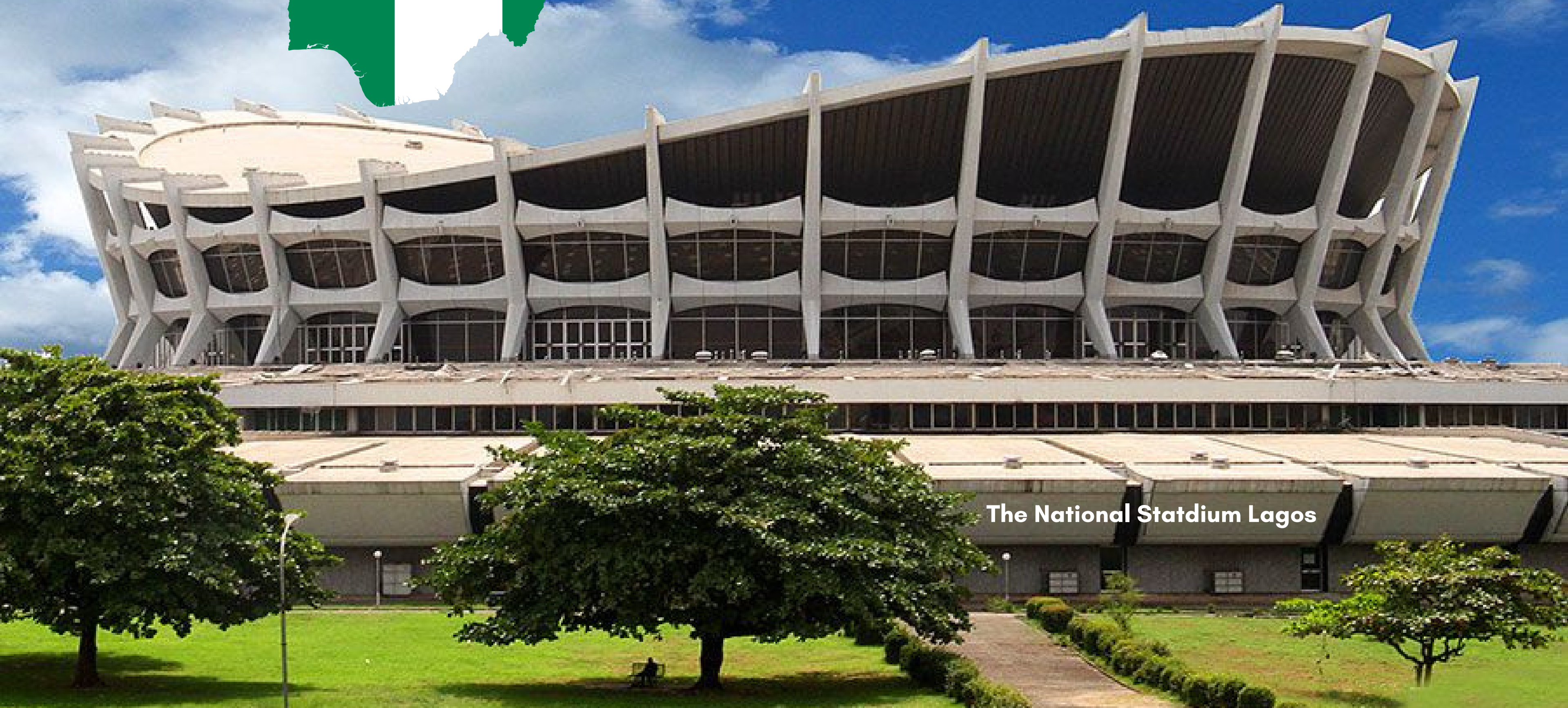
The National Stadium Lagos