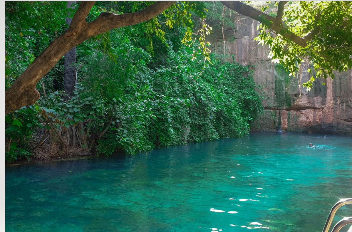
Swim with chimps and drink from the lions water in Yankari Game Reserve