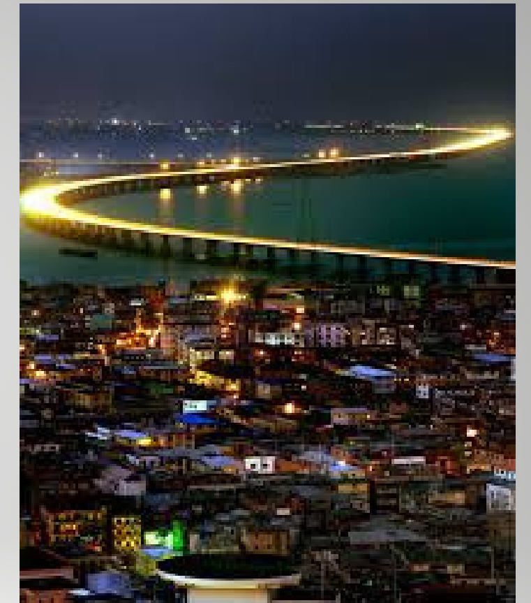
Third Mainland bridge, 2nd longest bridge in Africa