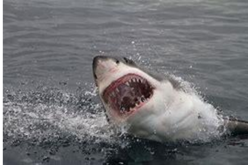
Great White Shark