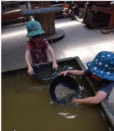
Panning for gold in Bendigo.