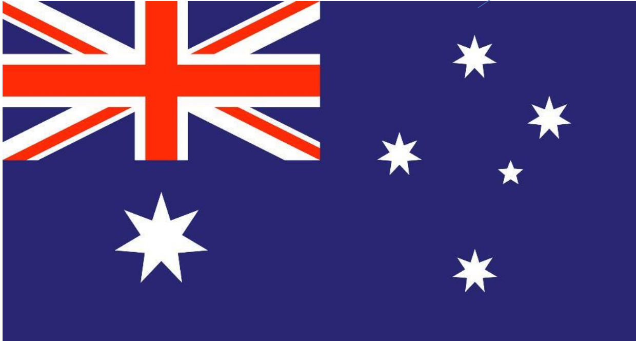
Australian National flag

The 5 stars on the right represent the Southern Cross. The points on the star on the left represents the states and territories of Australia and the Union Jack represents the link to the British Commonwealth.