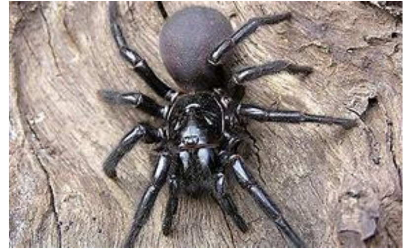
Funnel Web Spider