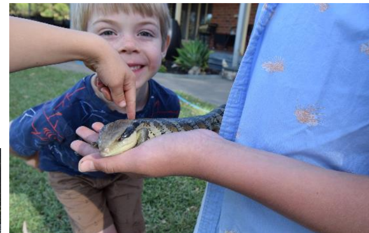
Our cousin's pet blue tonged skink.