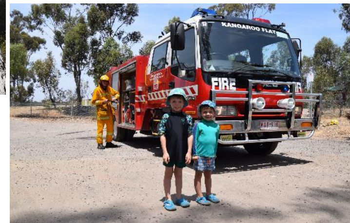
The fire crew came out to put out a fire that could have spread to the bush.

Our dad is from Australia and met my mum when she lived there. Our Australian family live in Melbourne and Bendigo so we went to visit.