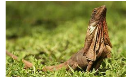
Frilled Neck Lizard