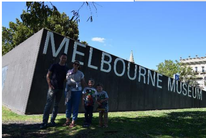
Relaxing with our family.