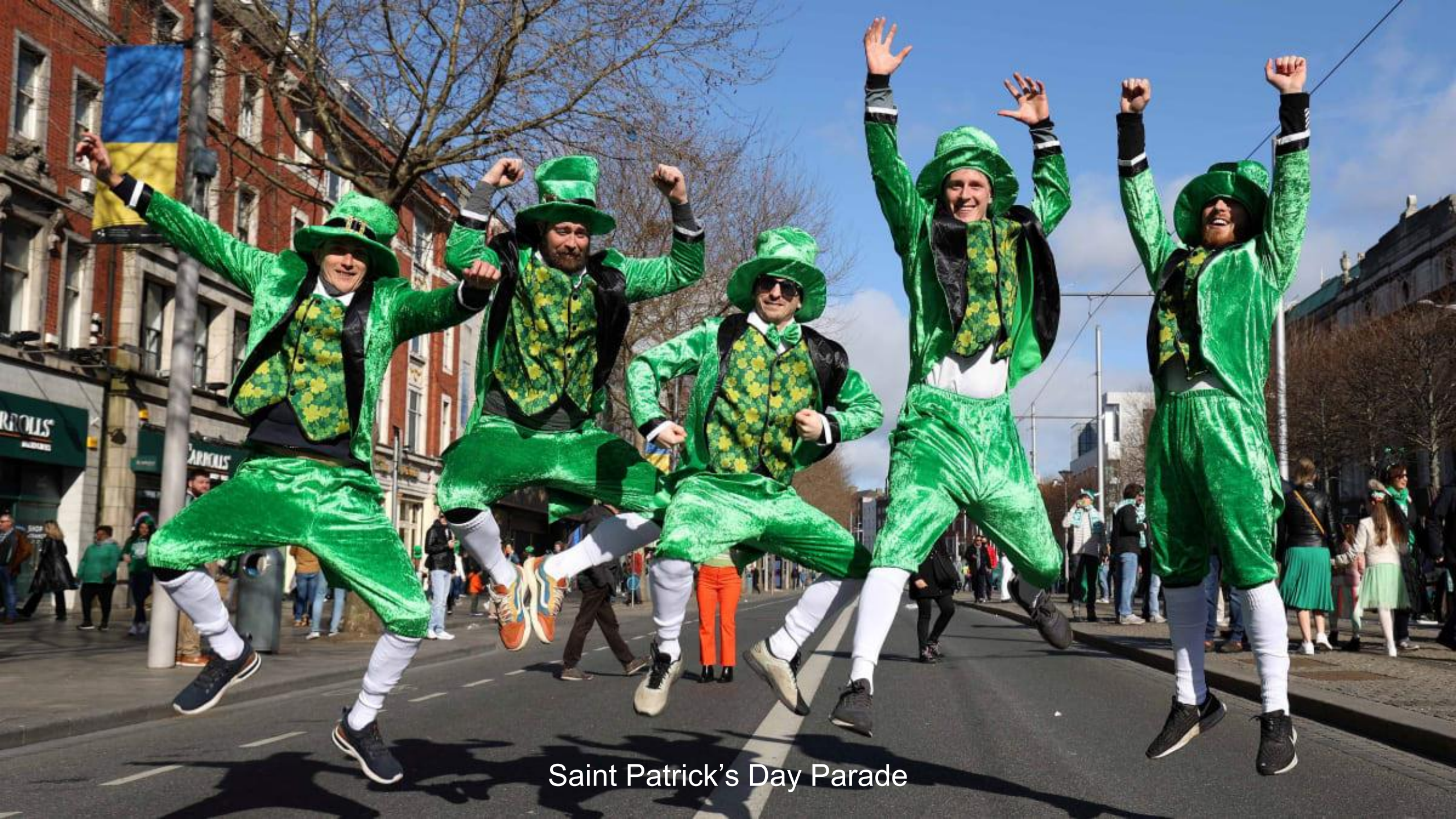
Saint Patrick's Day Parade