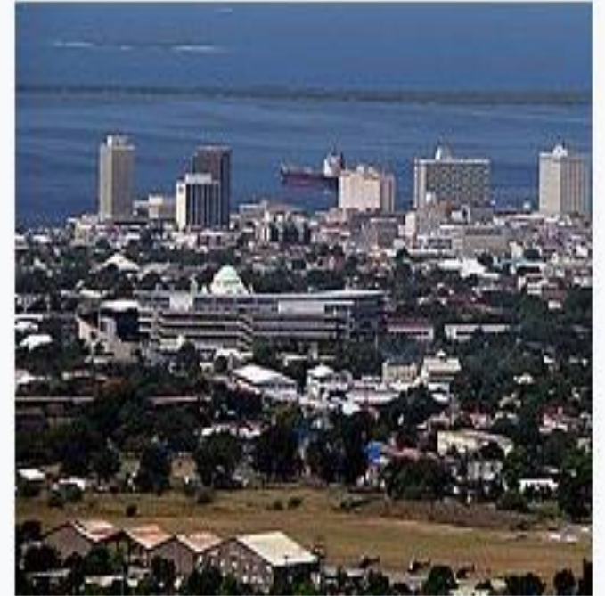
The port of Kingston in 2004