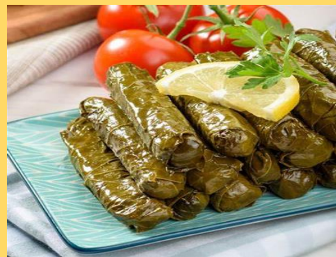
Stuffed Vine Leaves

Turkish cuisine is very popular throughout the world for a variety of reasons such as its influences from the Mediterranean to the Middle East and from Central Asia to Eastern Europe - some of the world's greatest cuisines.