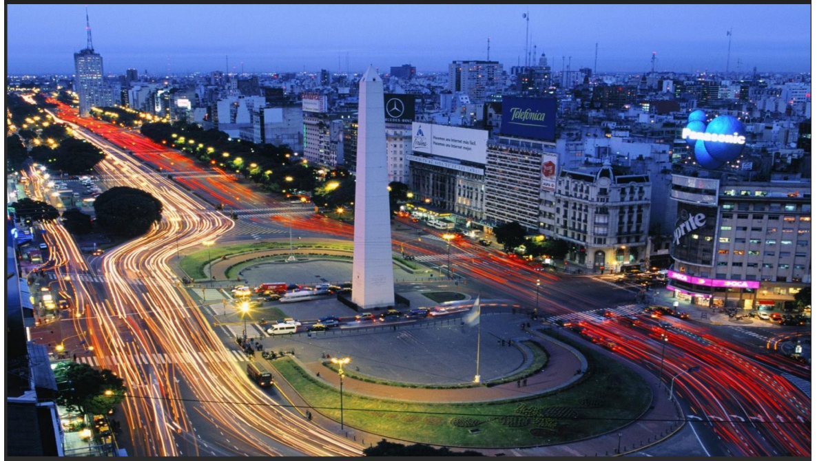
El Obelisco, Buenos Aires' trademark building.

It is a very big city with wide and long avenues everywhere, and it's sunny most of the time so you can go for long walks and enjoy this inspiring and exciting place.