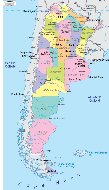
Map of Argentina

From the snowed-in south in Tierra del Fuego and Santa Cruz all the way up to the astonishing Jujuy with its arid dry heat, there's all kinds of weather, culture and landscapes to experience.