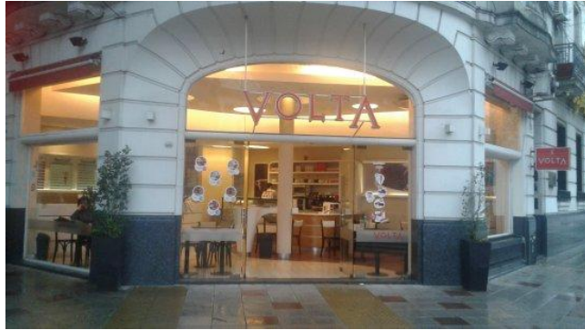
An ice-cream parlour in Buenos Aires.

France is well-known for its croissants, but a little-known secret is that the best ones are Argentina's medialunas! Fact!