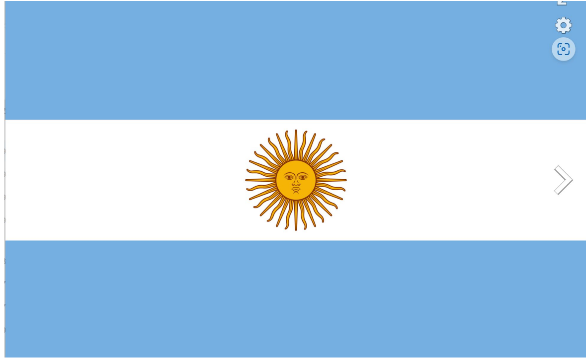
The Argentinian flag

The flag colors represent the sky, which inspired Manuel Belgrano when he created it, and the sun represents the Revolucion de Mayo (May's revolution), when Argentina declared independence from Spain in the early 19th century.