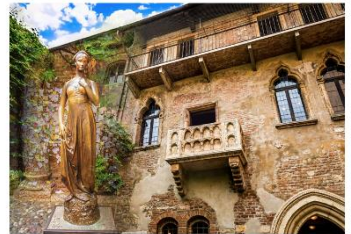
The Juliet's Balcony (Verona)