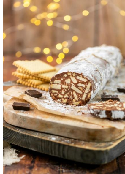
Salame di Cioccolata