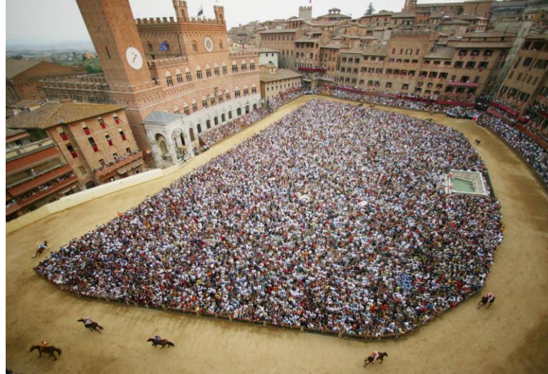
Palio di Siena

The night when the three kings arrive to the stable, January 6th, a good witch goes around every child's house and gives them sweets in a sock as a gift. That same night the people start a huge fire and burn a huge statue of the witch, made out from straw.