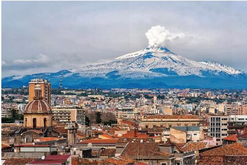
Volcano Etna (Catania, Sicily)