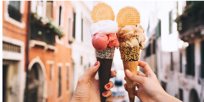
Gelato Italy is known for the worlds best Ice-cream