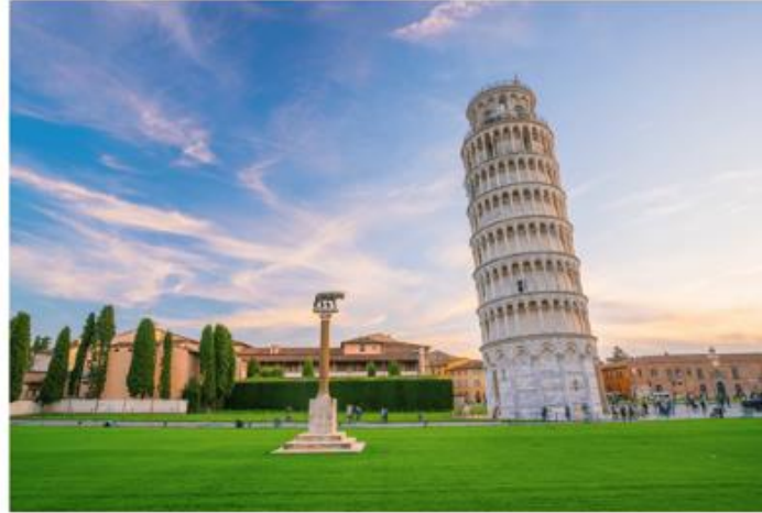
The leaning tower of Pisa