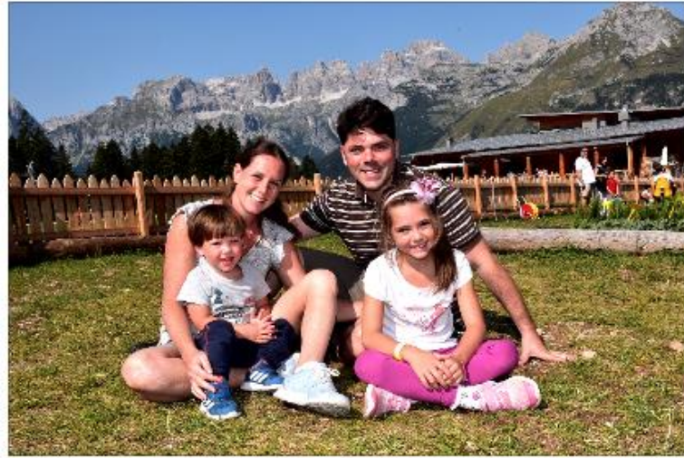
Mountains in summer...