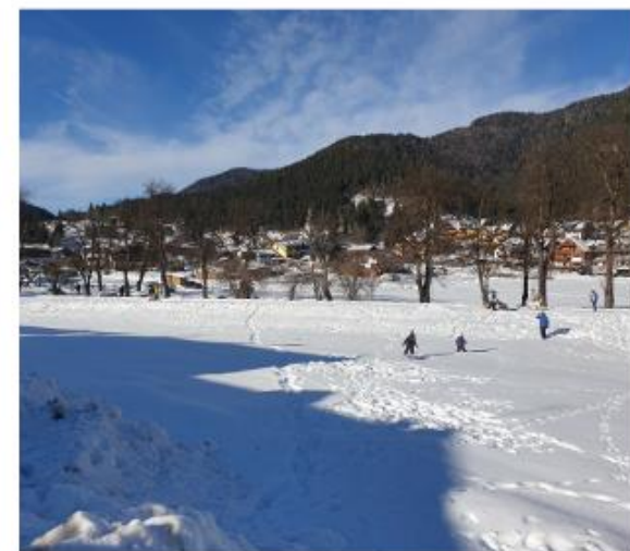
...and in winter