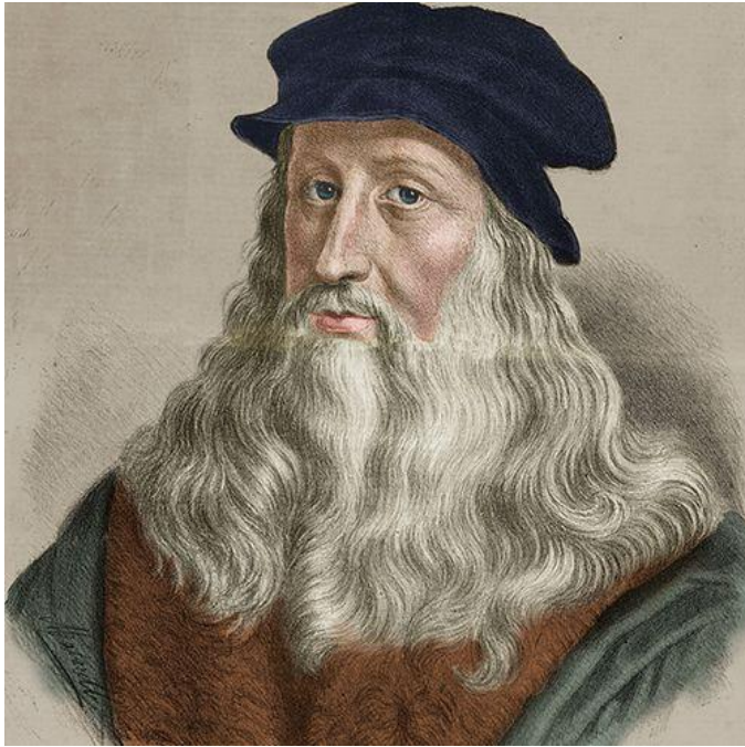
Leonardo da Vinci

Painter, engineer, scientist, theorist, sculptor, and architect.