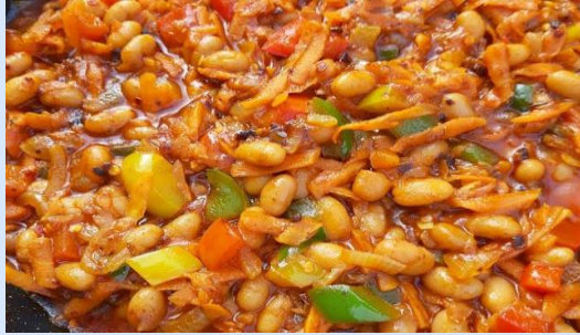
Chakalaka is beans, green and red peppers, grated carrots and spices

In South Africa we have a variety of amazing food