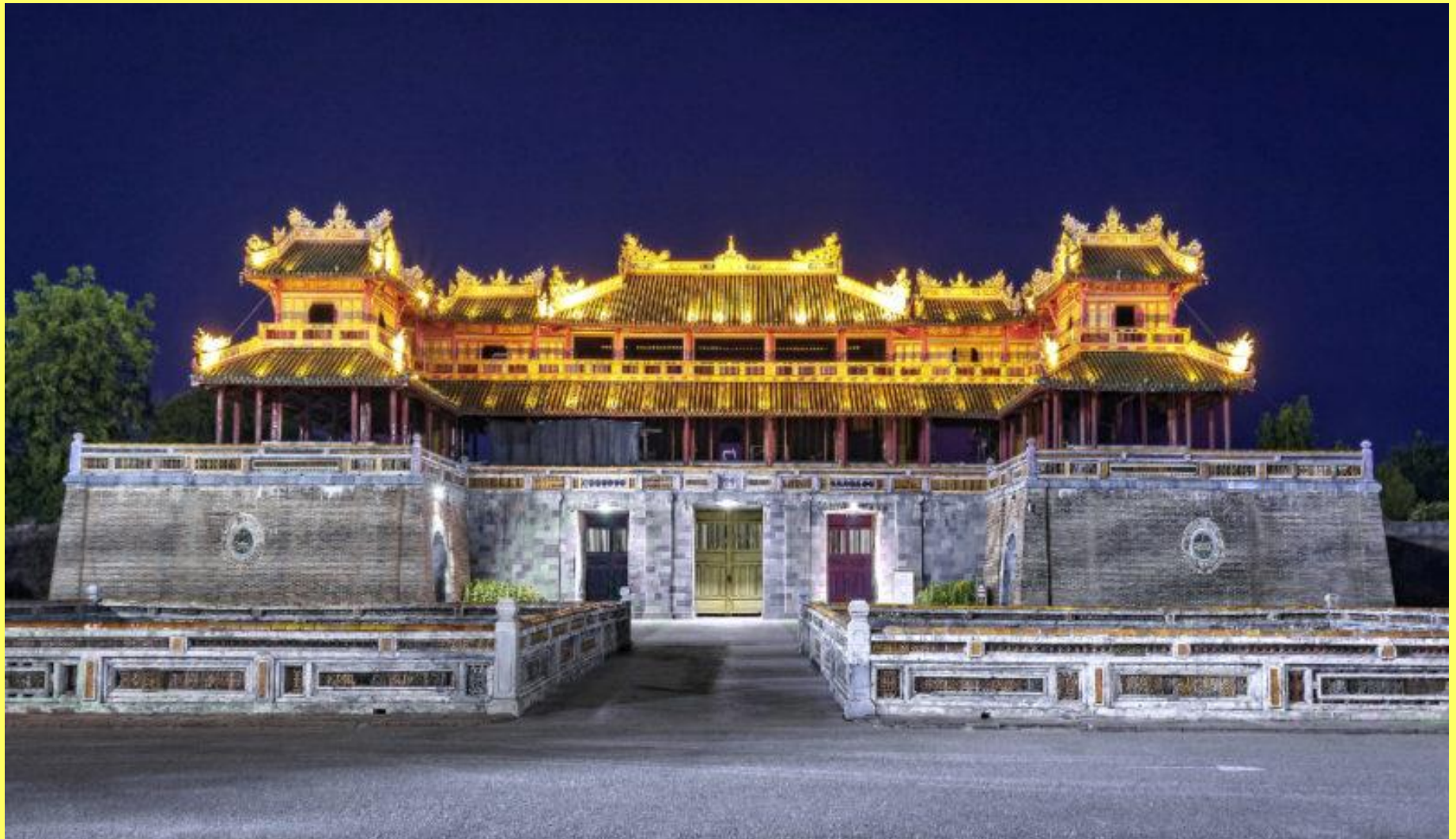
Kinh Thanh Hue: a temple in Hue, the capital of the Nguyen Dynasty (1805-1945)