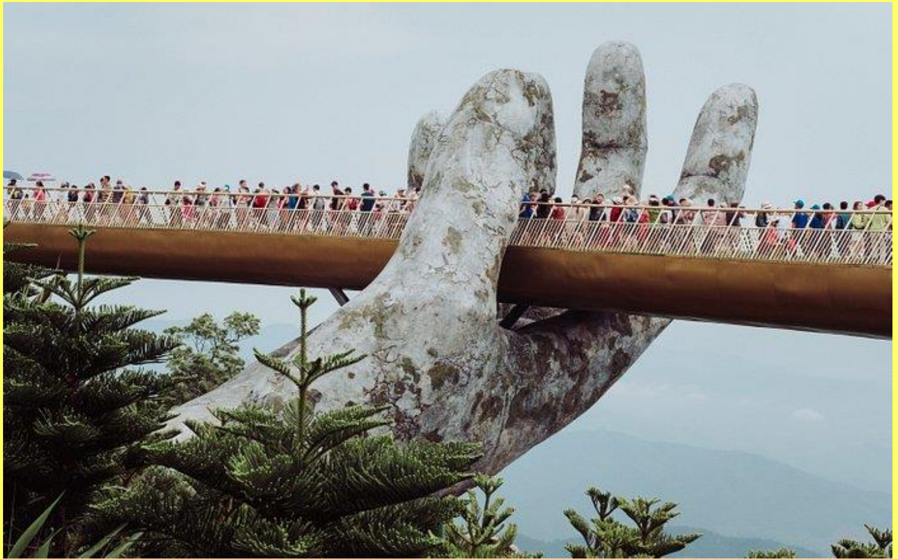
Cau Vang: THE GOLDEN BRIDGE