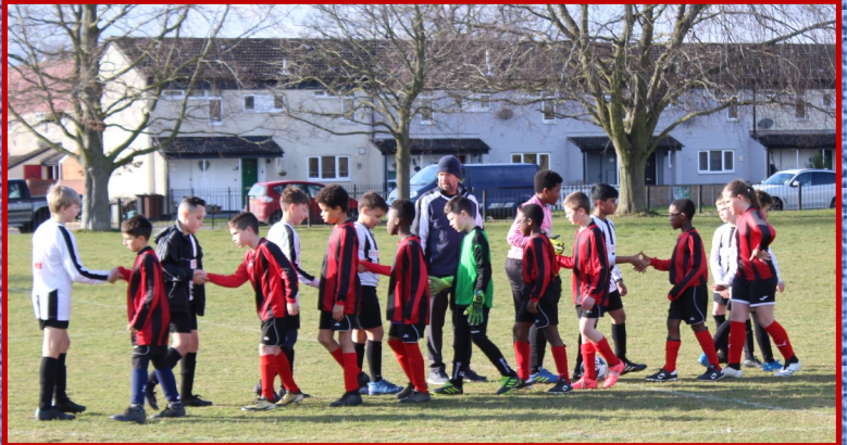
Pictured above—teams shaking hands before kick-off. Below, North on the attack (NB - no offside in 7-a-side)

Thanks to the parents who helped with transport. Next up Lexden.